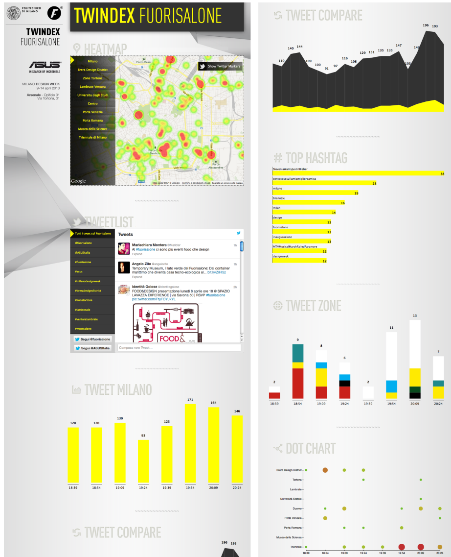
Fig. 2: The mashup published on the official Fuorisalone website by Studioblabo.