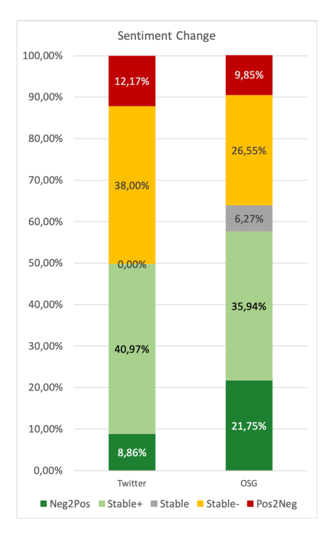
Figure 3: The sentiment polarity change in the two datasets - Twitter and OSG. Stable segments are labeled either as an increase (+), decrease (-) or no change in polarity, including neutral comments. Pos2Neg and Neg2Pos denote a nominal polarity change.

Table 2 presents the distribution of automatically predicted per-sentence Dialogue Acts in the datasets. The most frequent tag is statement in both. In Table 3, on the other hand, we present the distribution of post and comment structures in terms of automatically predicted Dialogue Act tags. The structure is an unordered set of tags in the post or comment. From the table we can observe that the distribution of tag sets is similar between posts and comments. In both cases the most common set is statement only. However, conversations containing only statement , emphasis or question posts and comments predominantly appear in Twitter. Which is expected due to the