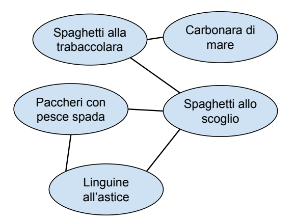
Figure 2: Connection between similar fish dishes.

cooking that dish, the number of mentions in food guide and the sentiment extracted from foodblogger articles and restaurant reviews.